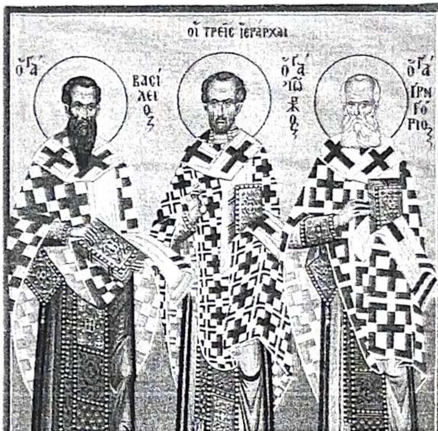
The Three Ecumenical Teacher and Hierarchs St Basil the Great, St John Chrysostom, St Gregory the Theologian. Feast 30 January

Please speak with me if you would like to help. I can bless the vestments in memory of one of your departed if you would like that.